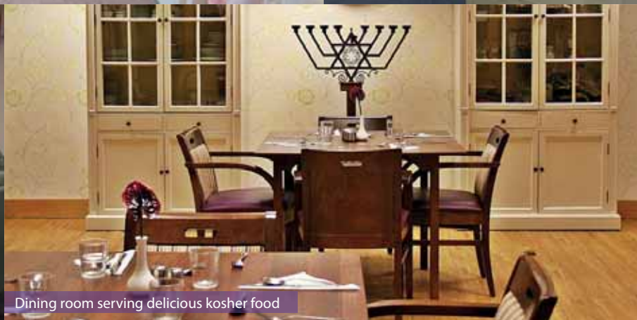
Dining room serving delicious kosher food