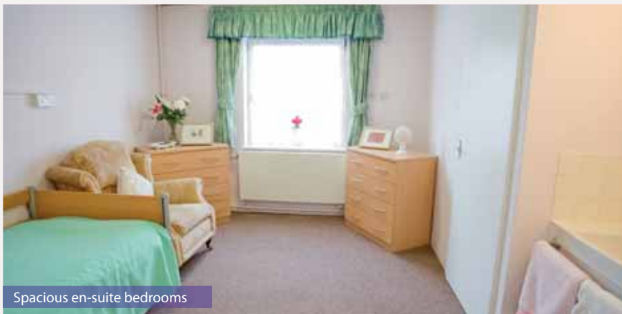
Spacious en-suite bedrooms